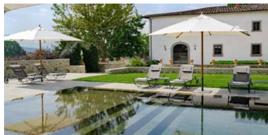
Below: Ferragamo Viesca estate