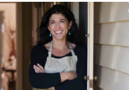
Culinary author and founder of Relish Mama cookery school